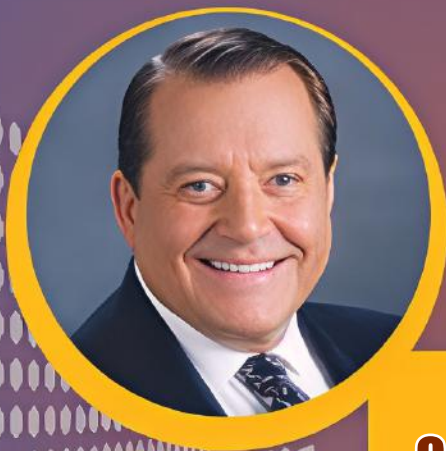
Bill Bright (1921-2003)